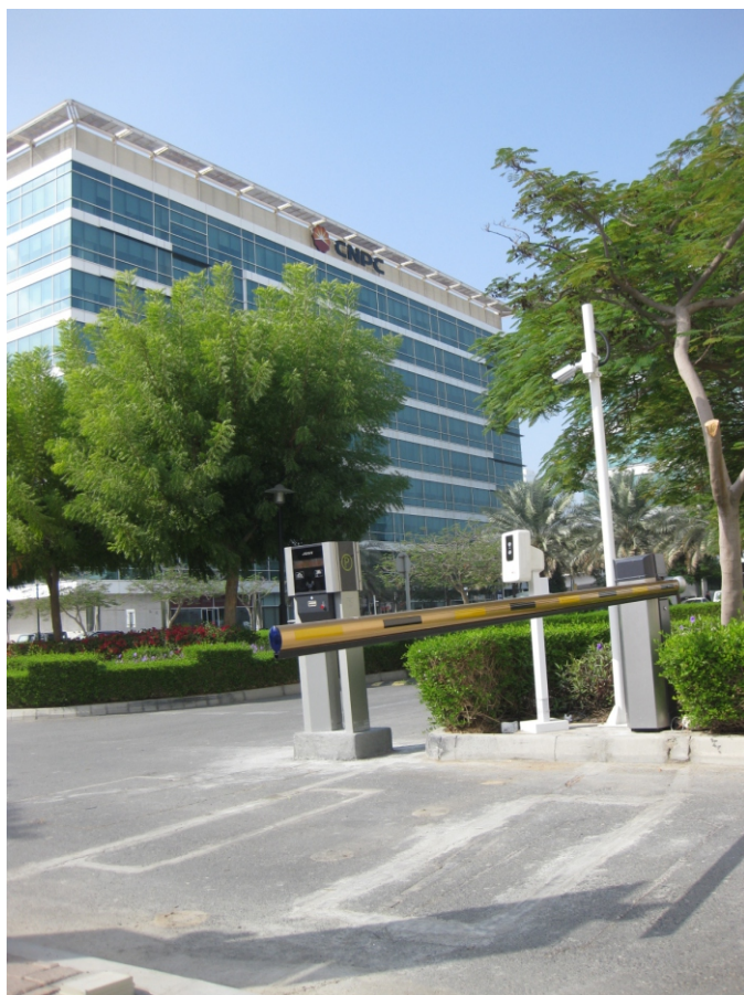
Office building in Dubai