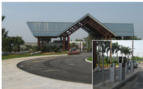
Shenzhen Golf Course