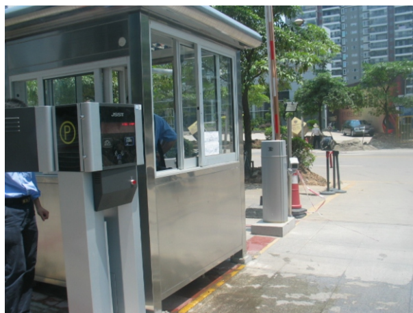
Shenzhen Long Gang City Center